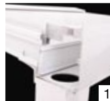
Integral rainwater drainage into post