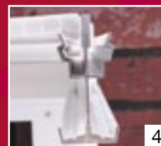
Easy to install Clip-Fit P.C. panels