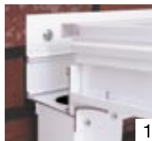
Eaves beam gutter fixed to wall as a box gutter