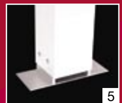
Variable post fixing allows water drainage