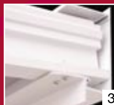
Wall plate fixed to wall