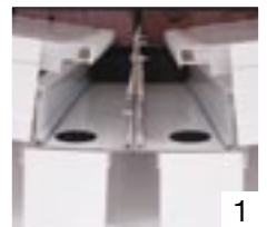
Eaves Beam Gutter in back to back application