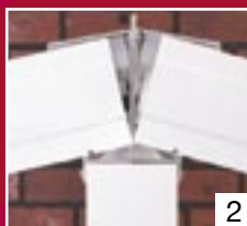
Wall plate back to back forming ridge application